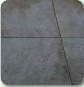
Clean the surface and remove all residues