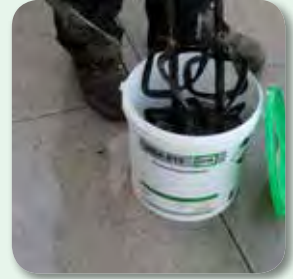
Mix thoroughly until homogeneous