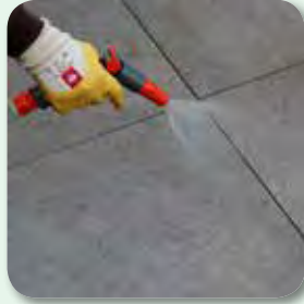
Wet the area