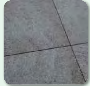
Observe directions for curing!