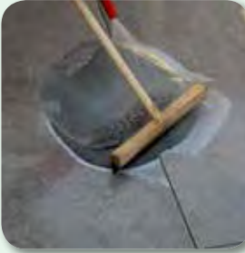
Work the mortar in