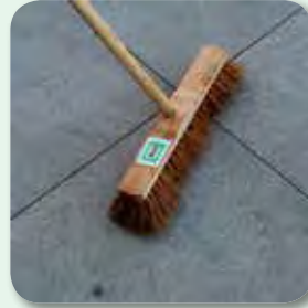
... and a damp coconut brush