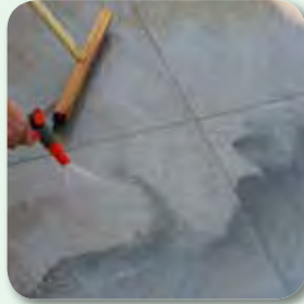
Clean with a hose spray ...